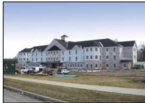
Windsor Estates Assisted Living is slated to open in the fall of 2011.

Windsor Estates will feature 54 apartments including spacious common areas, a private dining room, club room, activity room and beauty and barber salon. Each individual apartment will feature a kitchenette equipped with a microwave and refrigerator, wall to wall carpeting and individually controlled heating and air conditioning. Windsor Estates Assisted Living is scheduled to open in September 2011. Anyone wanting additional information can contact Masternick Memorial Health Care Center at 330.542.9542 or visit www.WindsorHouseInc.com .