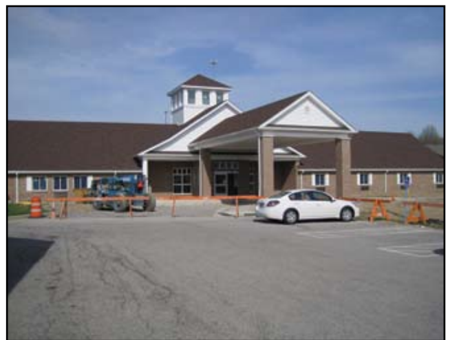
Liberty Health Care Center will have one of the finest therapy gyms in the Mahoning Valley.

The new addition, which is slated to open in late spring of 2011, was designed by Strollo Architects and is being built by B & B Contractors and Developers.